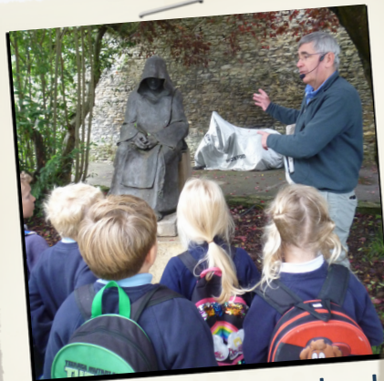
They had a tour from a local councillor