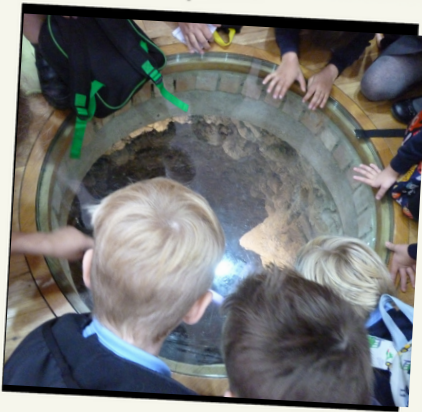
Elm class enjoyed their trip to Malmesbury this week.

A fact I had never considered is that if a child has an annual attendance of 90%, then they will have missed the equivalent of over a year of education between primary and secondary school.