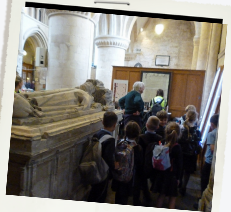
as well as visiting the abbey.