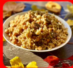
MIDDLE EASTERN PILAF