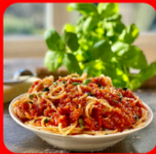
ITALIAN PASTA SAUCE