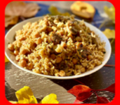
MIDDLE EASTERN PILAF