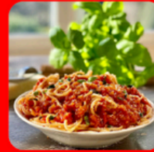
ITALIAN PASTA SAUCE